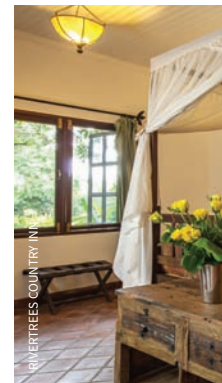
RIVER TREES COUNTRY INN